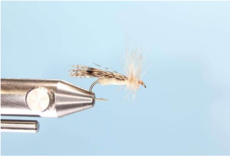
2. Completed AK Best Spent Caddis