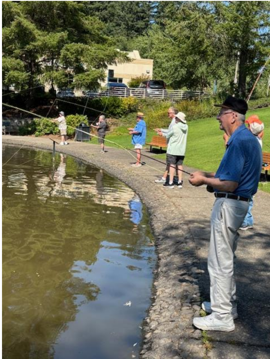
Casting Clinic, July 2025